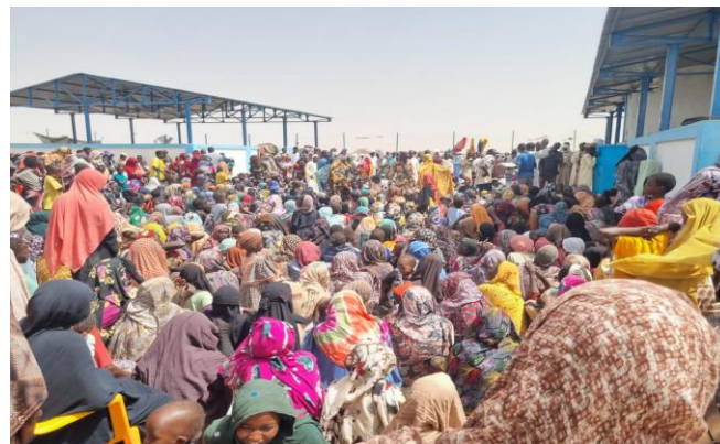
New arrivals from Sudan continue to cross into Wadi Fira and Ennedi Est Provinces, Chad, following attacks in El Fasher and Zam Zam IDP sites.